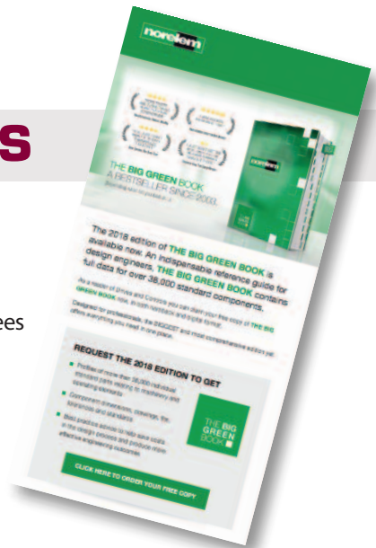
Example of E-Cast